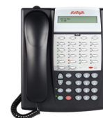
PARTNER 34-button display phone