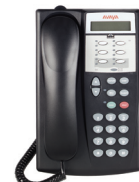
PARTNER 6-button display phone

Transfer a call...set up a conference call...create a list of frequently dialed numbers—PARTNER telephones make it easy. It's also simple to connect standard devices—no extra lines or adapters needed.