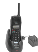
PARTNER wireless phone