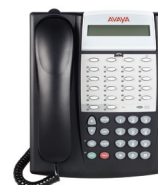
PARTNER 18-button display phone